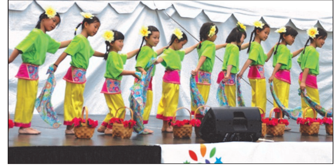
The Atlantic City Free Public Library's Chinese New Year celebration will include music and dance, paper folding, and calligraphy and paper cutting on Feb. 10.